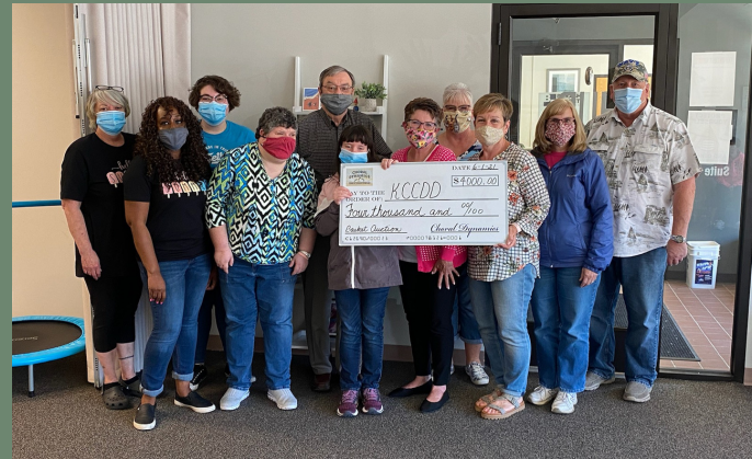
The entire Galesburg community has shared its ongoing support of each other during these times. KCCDD was the beneficiary of Choral Dynamic's online basket auction and we are thankful for their generosity. Pictured are members of Choral Dynamics with KCCDD staff and clients.

While COVID forced KCCDD to shut down for almost seven months, opening back up again has been such a good feeling for staff and clients! We are still following many restrictions, but have been able to find creative ways to continue serving our individuals.